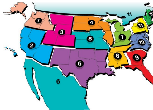
The Nationwide Bacchus Gamma Network