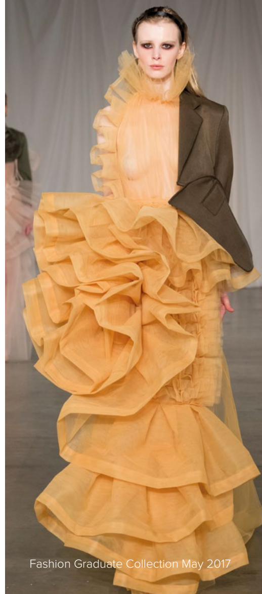
Fashion Graduate Collection May 2017

Postgraduate Diploma in Fashion Buying & Merchandising