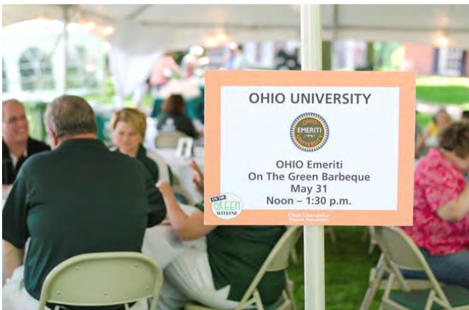
A special Emeriti tent was designated at the May 31 noon barbeque for participants in the first On the Green Weekend.