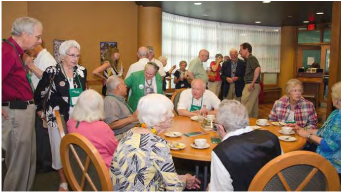
Emeriti and former colleagues and students enjoy chatting at the Emeriti reception in Latitude 39 on May 31.