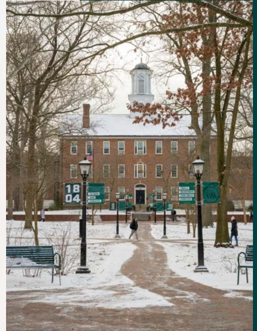
First Day Snowfall-College Green