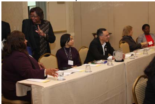
Preconference Concurrent Session 2008

The NAMRC conference in conjunction with NRA, served as our first preconference. The smaller format allowed for a condensed version of the NAMRC conference - packed with the socialization and information available at the full conference. We were able to exceed our expectations!