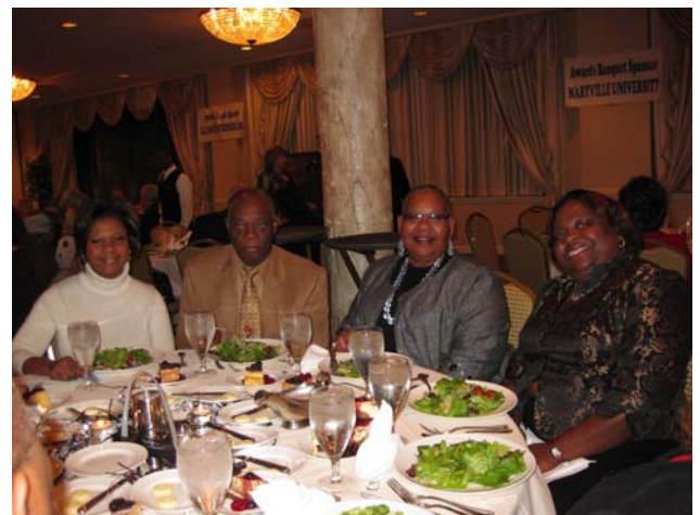
Awards Dinner at NRA conference 2008