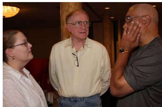
Preconference Networking 2008