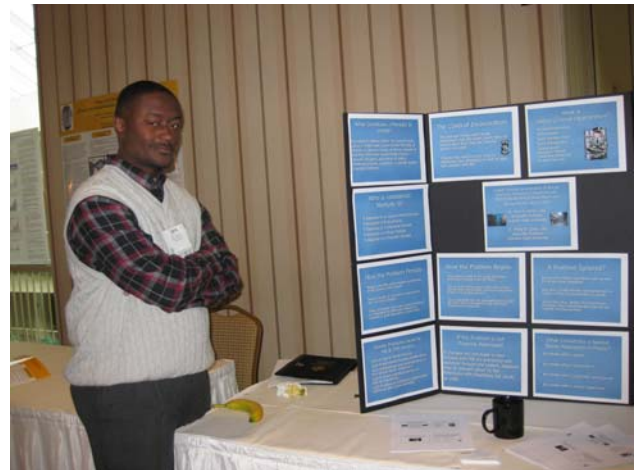
Pre-conference Poster Presentation 2008

NAMRC is a diverse group whose purpose is to advocate for the rehabilitation needs of multicultural persons with disabilities and equitable services; and enhance the development of multicultural rehabilitation professionals.