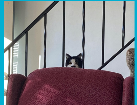
Rosie is always watching