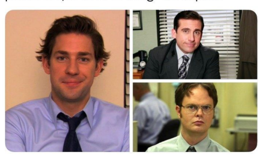
11/7/18, 1:39 PM

one taught me love, one taught me patience, and one taught me pain