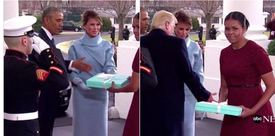
Melania giving Michelle her speech back